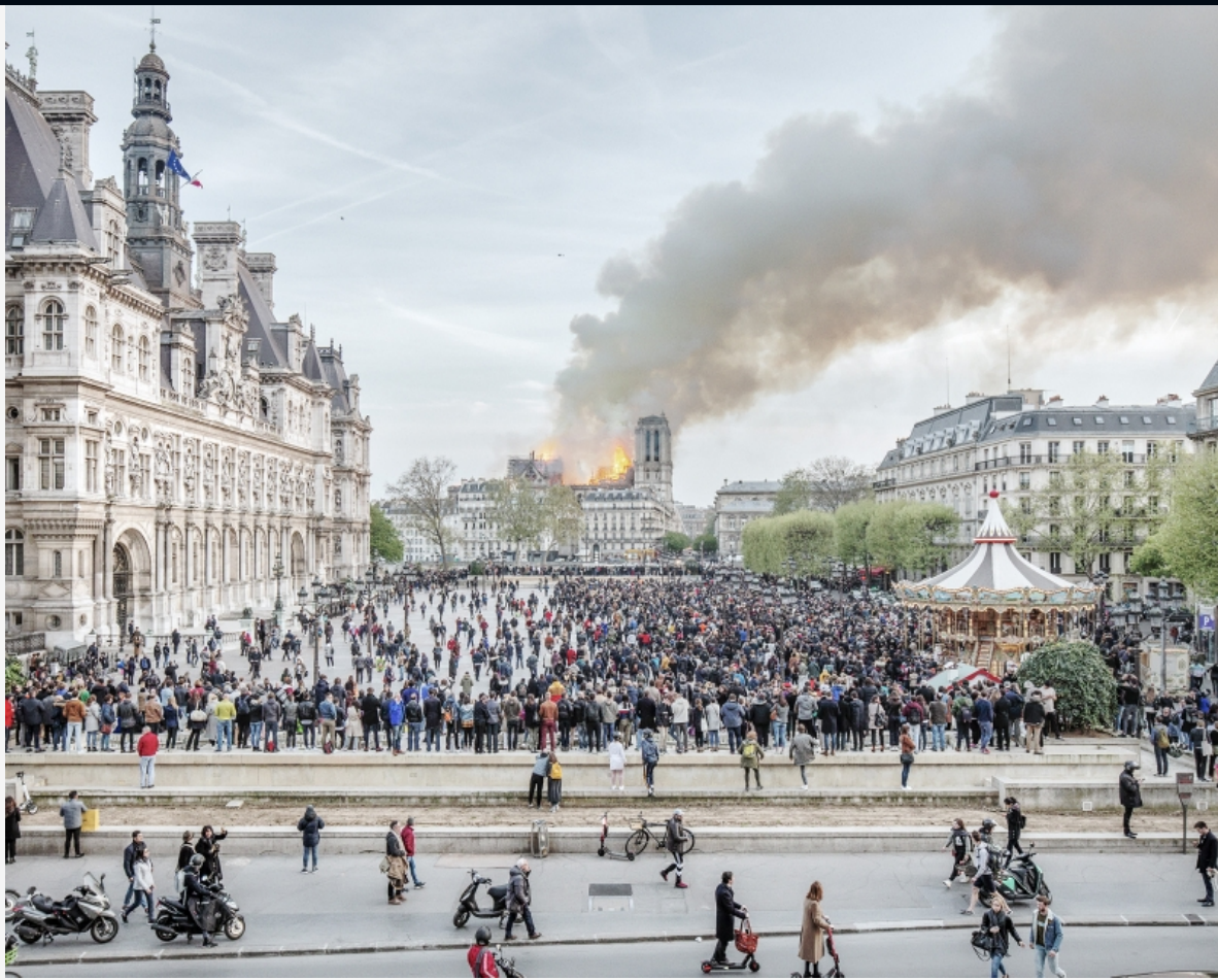
15.04.2019, Notre-Dame de Paris - Silver in Press (Px3 2020).